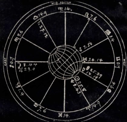
HOROSCOPE OF THE ASSASSINATION OF ABRAHAM LINCOLN, APRIL 14, 1865.

The anniversary of the assassination, April 14, 1865, of Abraham Lincoln may fittingly be illustrated astrologically. Herewith are presented the horoscope of his birth, and that of his death by the hand of Booth, the assassin. The birth figure is, by a remarkable coincidence (which not infrequently happens), the same as the horoscope of the assassination, so far as the zodiacal signs are con-