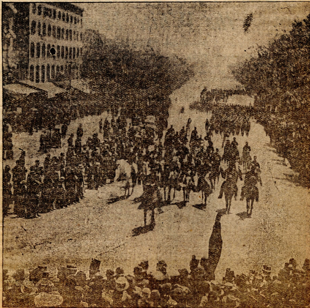
Grant's Soldiers Passing Through Washington After Lee's Surrender

In the spring of 1865 the Confederate army of Virginia appeared to be thoroughly demoralized. There was said to be more than 3,000 deserters from their ranks in and around Washington who reported that their men from Alabama, Georgia, Florida and the Carolinas could not be expected to have any heart in a fight which now seemed only for the defense of Virginia. And this was the condition of the Confederate troops when, on April 1st, 1865, General Grant turned Lee's right flank at Five Forks. The next day he assaulted and carried their lines at Petersburg, and the following day, April 3rd, our troops at last entered Petersburg and the burning city of Richmond. Five days after Richmond fell, the Northern cavalry were thrown across the line of Lee's retreat, and the following day, Sunday, April 9th, the memorable surrender of the