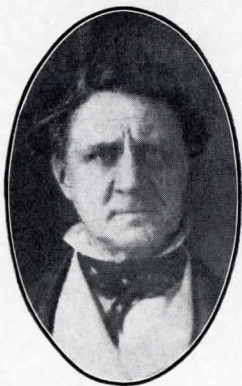
JUNIUS BRUTUS BOOTH

Tudor Hall, this most interesting example of English architecture, was built by Junius Brutus Booth, who came to this country from England in the year 1820.