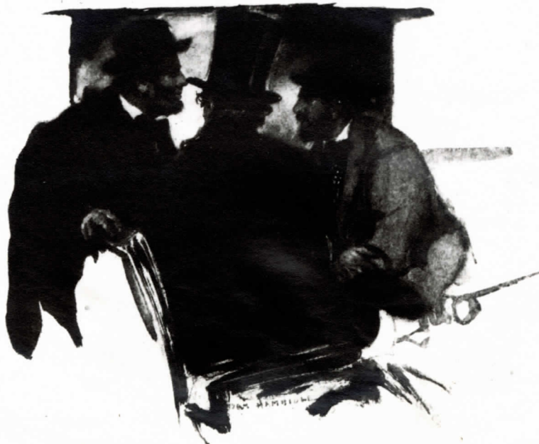
"All the night through Mr. Lincoln, being unable to sleep, had been telling us jokes and stories . . . but in a voice so low and subdued no one heard him but Lamon and me"