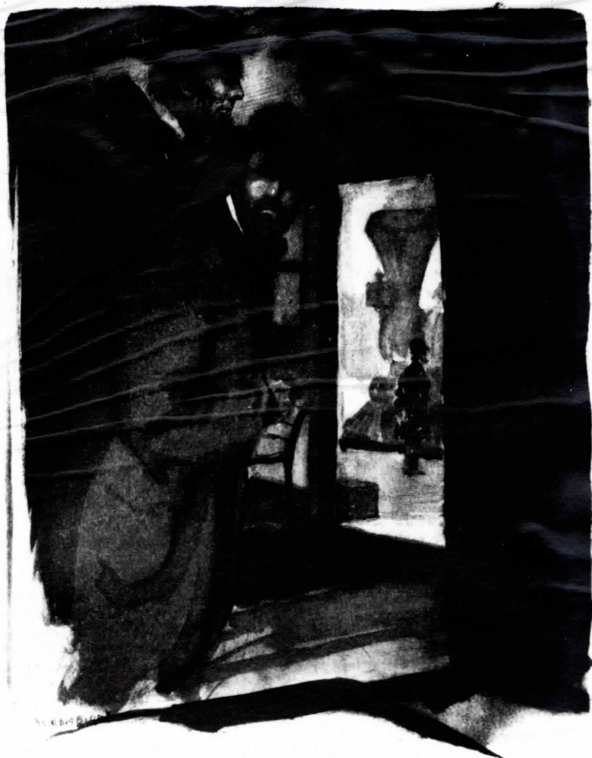
"We passed rapidly through the depot"